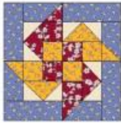
Turnstile 12" block 4 Fabrics