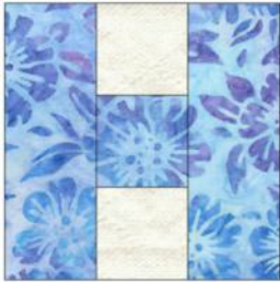
H Quilt Block 6" block 2 Fabrics