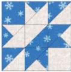
Snowflake 12" Block 2 Fabrics